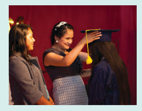
Ericka placing a cap on a graduating student

Bonus! If you're one of the first 40 people to support a class at $50/month, an additional $250 will be donated towards health benefits for our teachers, thanks to a generous donor.