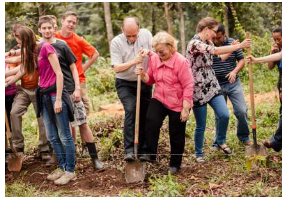
Ground-breaking of the Vida Children's Home!