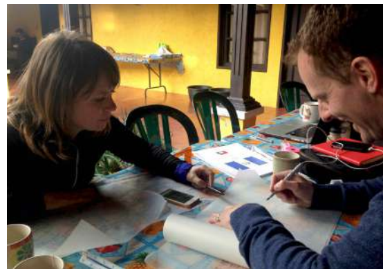
Engineering team creating the master plan.

Thank you to each one of you who has dreamed with us and has been a part of these unfolding miracles. And thank you for continuing to champion the cause of the little ones in our care.