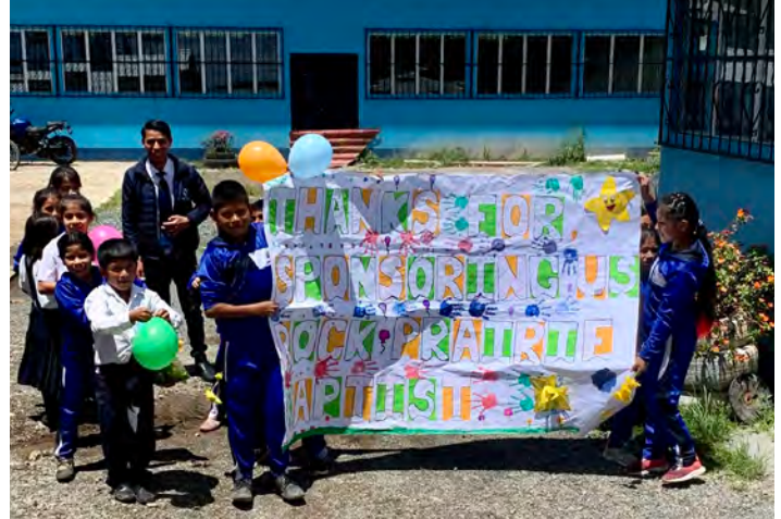
A huge banner welcomes the Rock Prairie team as they meet their sponsor class